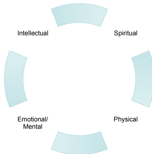
Figure 1.0 – An Aboriginal Model of Self-Esteem

Figure 1.0 - These four aspects represent 'self' and these are interconnected. Balance in all these areas is imperative to an individuals' sense of self.